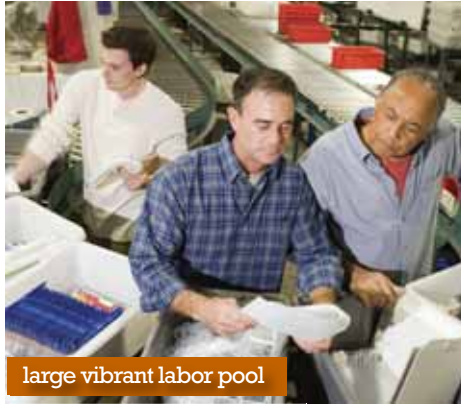
large vibrant labor pool