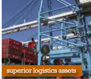
superior logistics assets