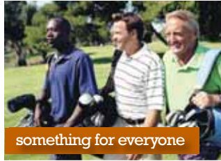
something for everyone