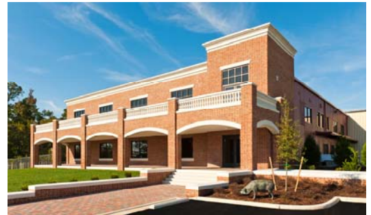
Smithfield Innovation Center

In March 2011, Smithfield Foods announced two new projects at its facilities in the Town of Smithfield. The company will process pet proteins for Premium Pet Health LLC, which is owned by John Morrell and Co., a subsidiary of Smithfield Foods. Premium Pet Health is a leading protein by-product process that supplies many of the leading pet food processors in the U.S. This new operation is located in the former Smithfield Packing plant and will employ 25 to 30 people.